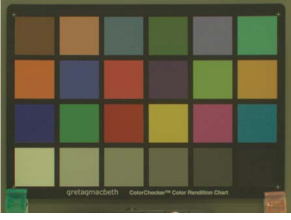
2500lx, Gain Analog 6 dB