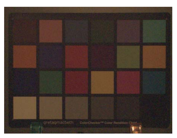
10lx, Gain Analog 18 dB, Gain Digital 6 dB